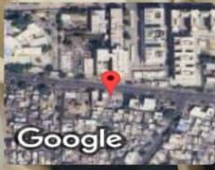
Ahmedabad, Gujarat, India 🇮🇳 2jx3+gwq, Civil Hospital Rd, Patel Society, Asarwa, Ahmedabad, Gujarat 380016, India Lat 23.049173° Long 72.604736° Monday, 25/05/2026 03:07 PM GMT +05:30