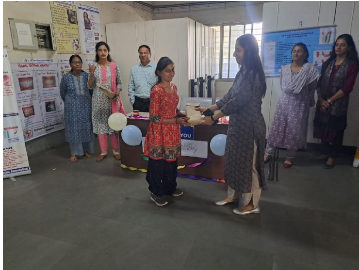
PHOTOS OF RANGOLI COMPETITION